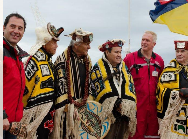
Aboriginal People supporting and encouraging your plans