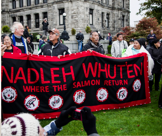
Aboriginal People protesting and resisting your plans